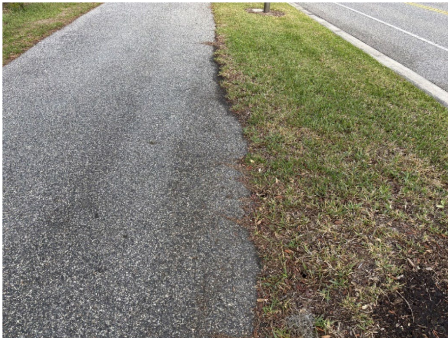
Photo 45 Asphalt Pavement Edge Failure (No Observed Changes) (Refer to Prior Photo 60 – 2025 Assessment)