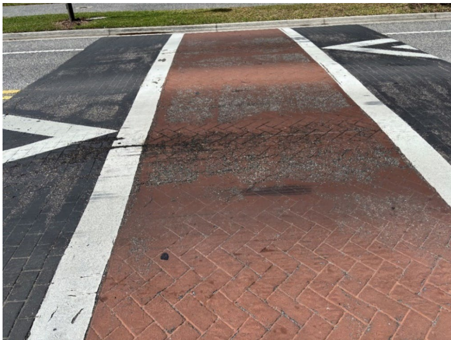
Photo 46 Deteriorating Thermoplastic, Worn Crosswalk Coloration, and Asphalt Deformation (Further Deterioration Observed) (Refer to Prior Photo 62 – 2025 Assessment)