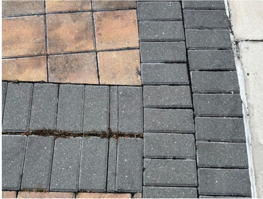
Photo 57 Broken Concrete Pavers on Truck Apron (No Observed Changes) (Refer to Prior Photo 77 – 2025 Assessment)