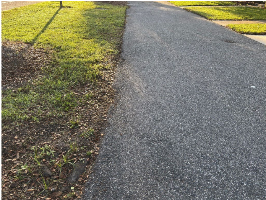
Photo 4 Asphalt Pavement Edge Failure (Increasing Edge Failure Observed) (Refer to Prior Photo 4 – 2025 Assessment)