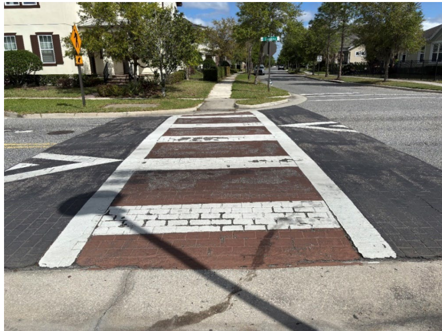
Photo 40 Deteriorating Thermoplastic and Worn Crosswalk Coloration (Further Deterioration Observed) (Refer to Prior Photo 55 – 2025 Assessment)