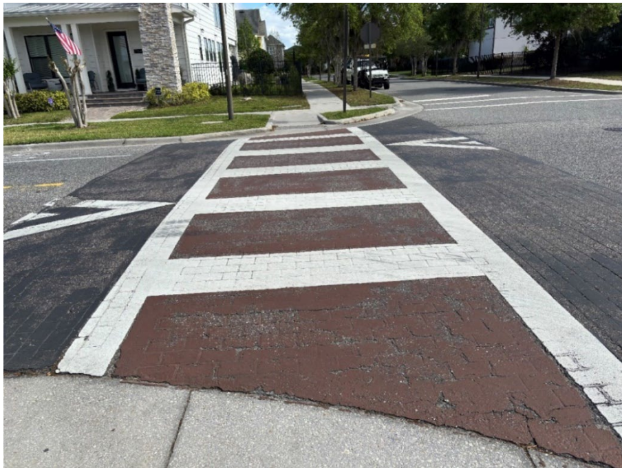
Photo 38 Deteriorating Thermoplastic and Worn Crosswalk Coloration (No Observed Changes) (Refer to Prior Photo 53 – 2025 Assessment)