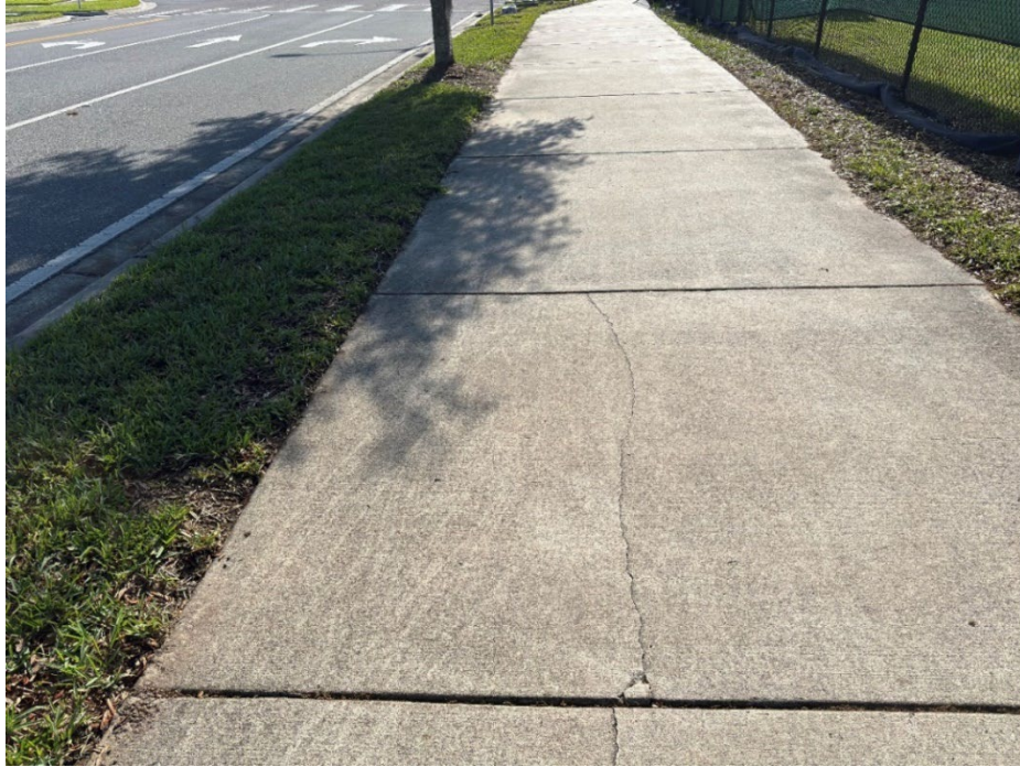
Photo 21 - Surficial Cracked Concrete (No Observed Changes) (Refer to Prior Photo 29 – 2025 Assessment)