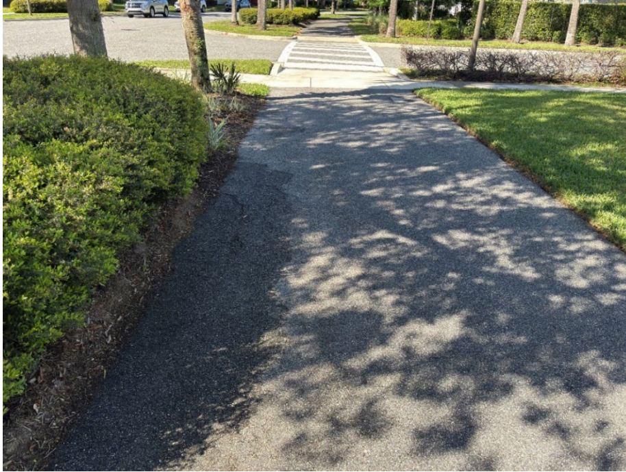
Photo 31 - Asphalt Raveling (No Observed Changes) (Refer to Prior Photo 40 – 2025 Assessment)