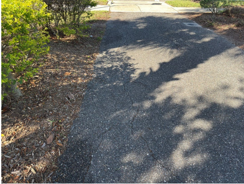
Photo 25 - Asphalt Raveling (No Observed Changes) (Refer to Prior Photo 34 – 2025 Assessment)