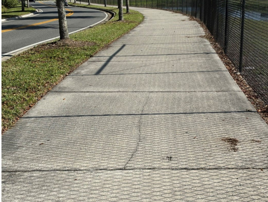
Photo 20 - Surficial Cracked Concrete (No Observed Changes) (Refer to Prior Photo 27 – 2025 Assessment)