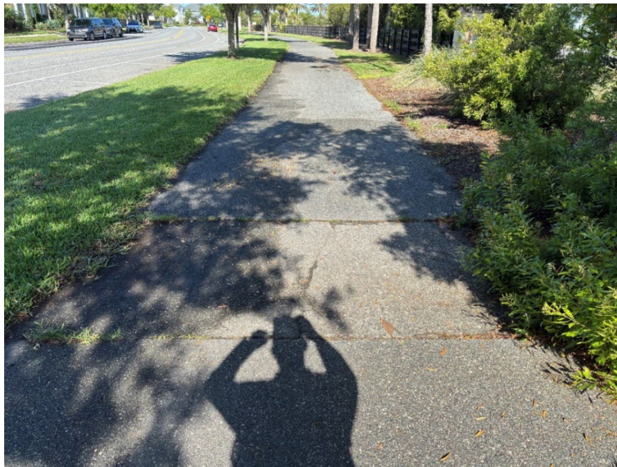
Photo 24 Poor Quality Asphalt Patch (Asphalt Patch Edge Failure Observed) (Refer to Prior Photo 33 – 2025 Assessment)