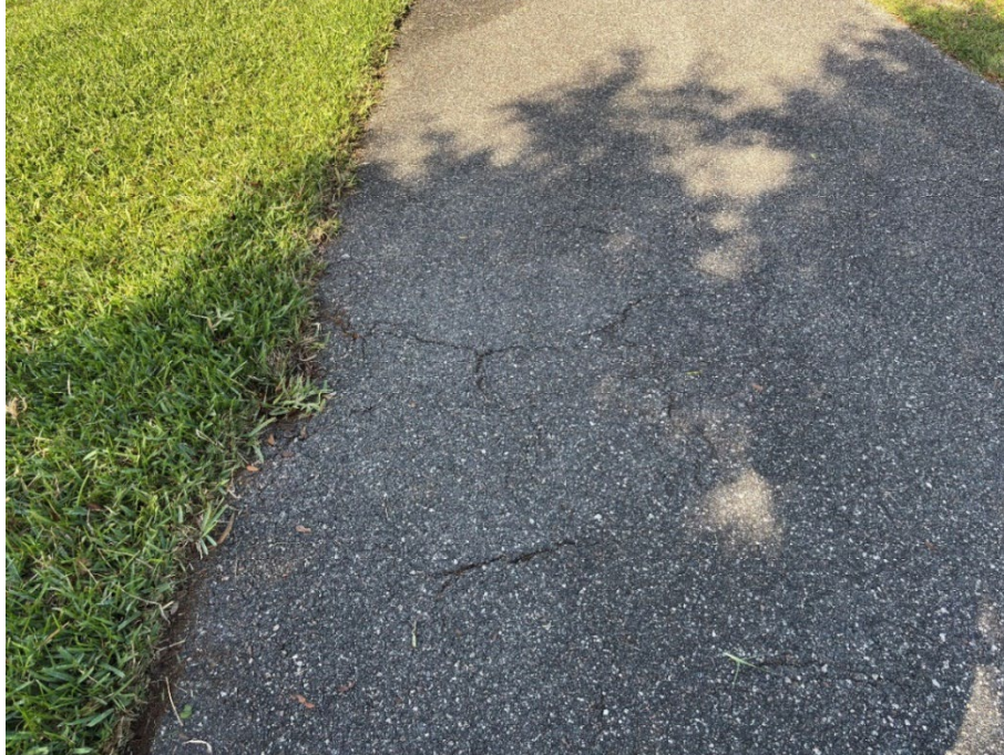
Photo 23 Asphalt Raveling and Base Failure (No Observed Changes) (Refer to Prior Photo 31 – 2025 Assessment)