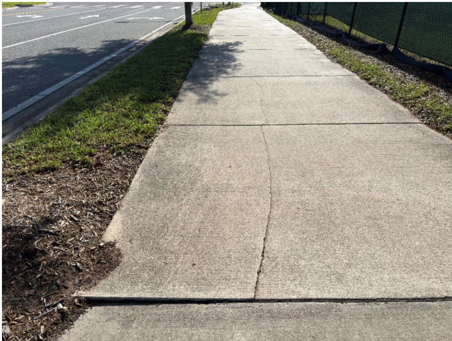
Photo 20.1 - Cracked Concrete (Additional Slab Movement Observed) (New Photo – 2026 Assessment)