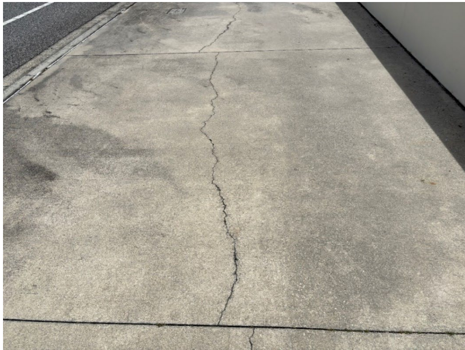
Photo 51 - Surficial Cracked Concrete (No Observed Changes) (Refer to Prior Photo 70 – 2025 Assessment)