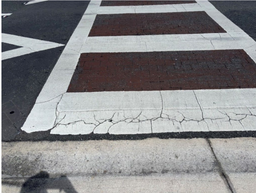
Photo 55 Deteriorating Thermoplastic and Worn Crosswalk Coloration (No Observed Changes) (Refer to Prior Photo 75 – 2025 Assessment)