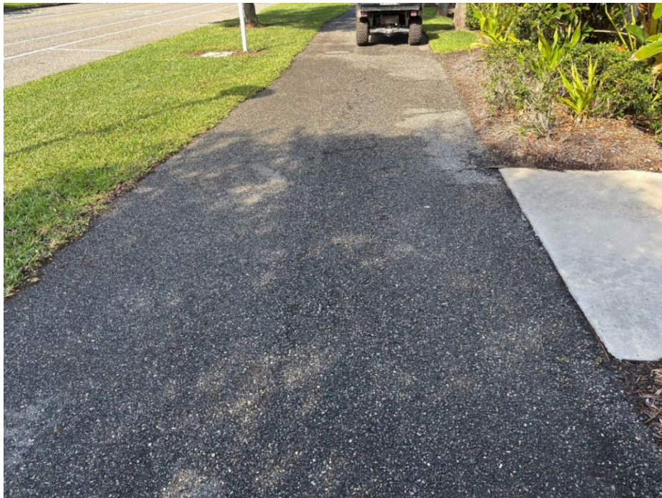
Photo 32 - Asphalt Raveling (No Observed Changes) (Refer to Prior Photo 42 – 2025 Assessment)