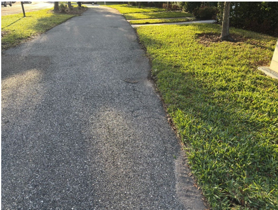
Photo 2 Asphalt Pavement Edge Failure (Increasing Edge Failure Observed) (Refer to Prior Photo 2 – 2025 Assessment)