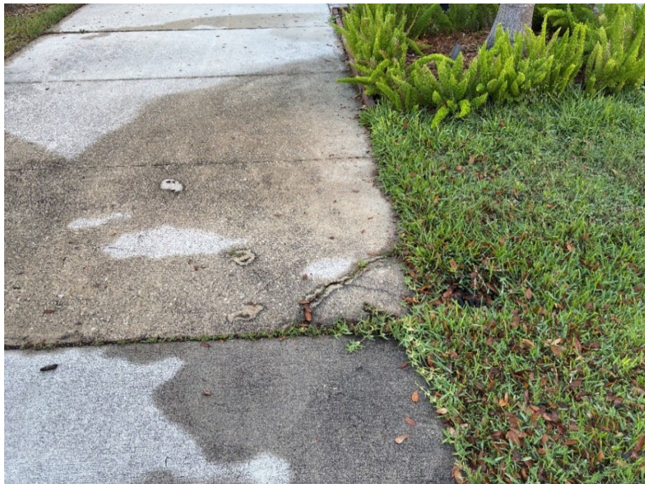
Photo 11 Cracked Concrete and Base Failure at Yard Drain (Base Failure Progressing) (Refer to Prior Photo 15 – 2025 Assessment)