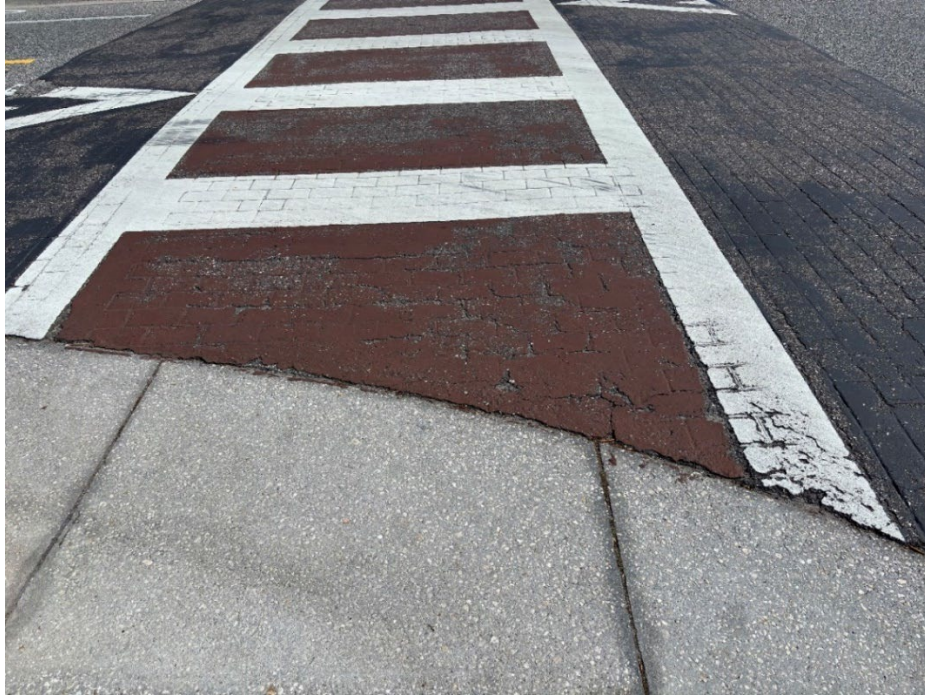
Photo 39 Deteriorating Thermoplastic and Worn Crosswalk Coloration (No Observed Changes) (Refer to Prior Photo 54 – 2025 Assessment)