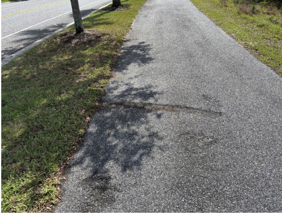
Photo 44 - Damage and Uneven Asphalt (No Observed Changes) (Refer to Prior Photo 59 – 2025 Assessment)