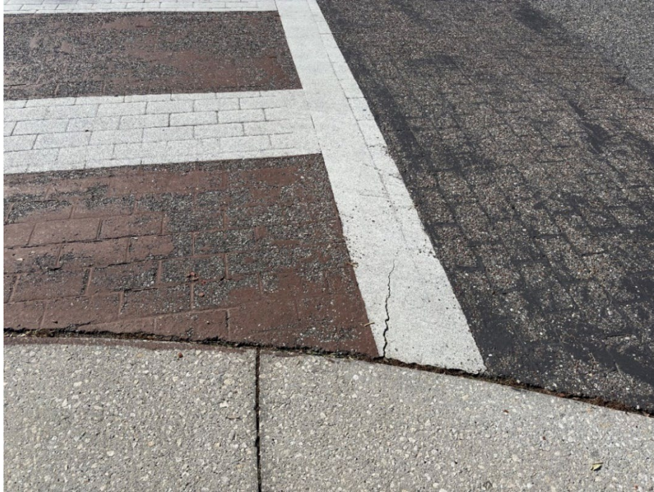
Photo 27 Deteriorating Thermoplastic and Worn Crosswalk Coloration (No Observed Changes) (Refer to Prior Photo 36 – 2025 Assessment)