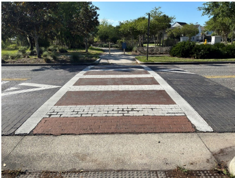
Photo 22 - Deteriorating Thermoplastic and Worn Crosswalk Coloration (Further Deterioration Observed) (Refer to Prior Photo 30 – 2025 Assessment)