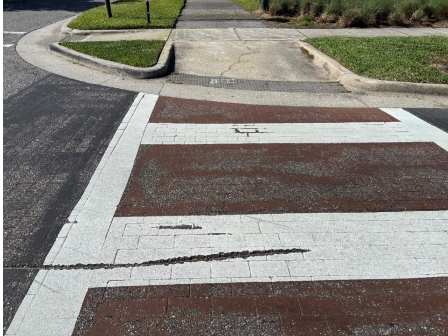
Photo 35 Deteriorating Thermoplastic and Worn Crosswalk Coloration (No Observed Changes) (Refer to Prior Photo 50 – 2025 Assessment)