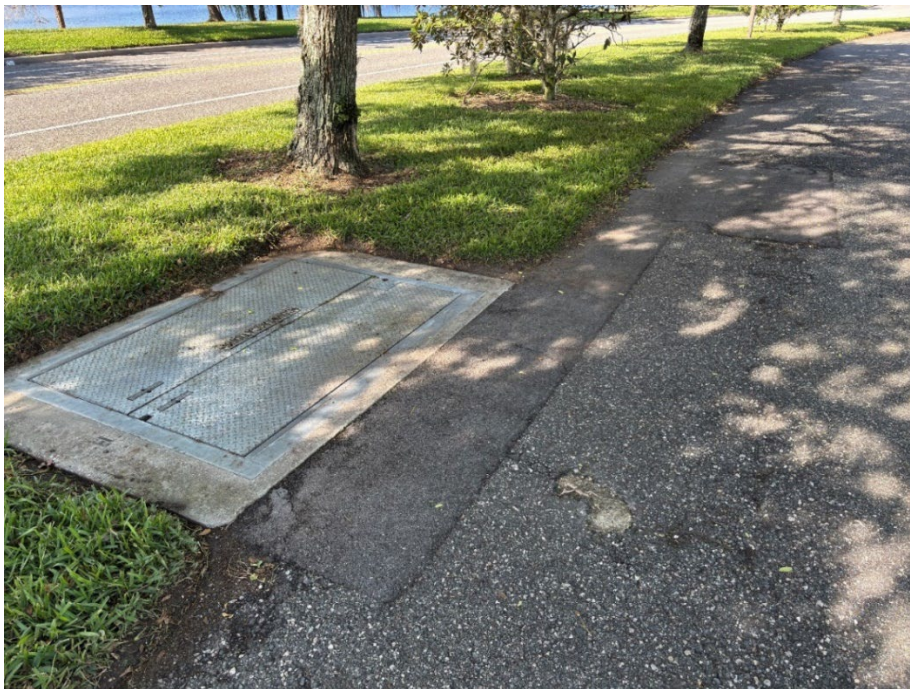
Photo 28 Poor Quality Asphalt Patch (No Observed Changes) (Refer to Prior Photo 37 – 2025 Assessment)