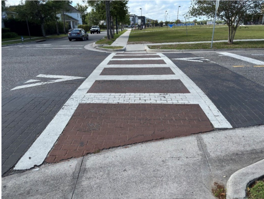
Photo 36 Deteriorating Thermoplastic and Worn Crosswalk Coloration (No Observed Changes) (Refer to Prior Photo 51 – 2025 Assessment)