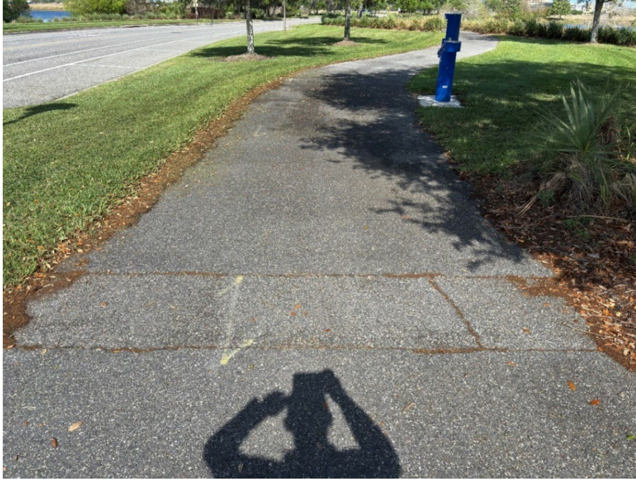
Photo 33.2 - Multiple Cracked Asphalt and Asphalt Raveling (New Photo – 2026 Assessment)