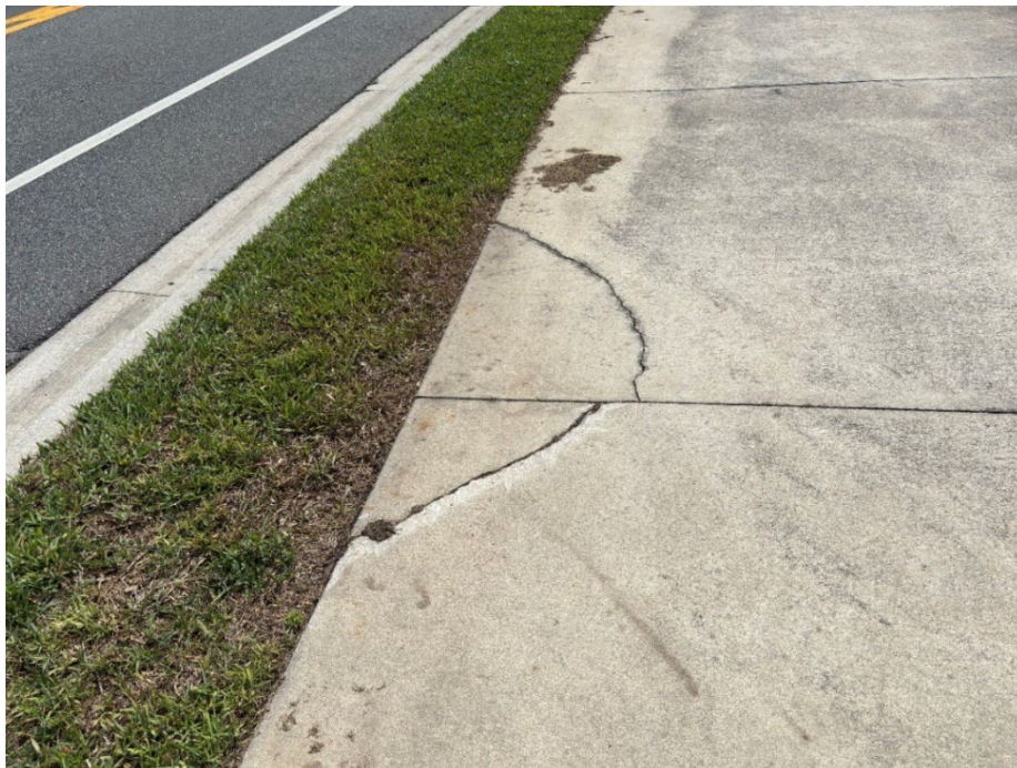
Photo 52 - Cracked Concrete and Base Failure (No Observed Changes) (Refer to Prior Photo 72 – 2025 Assessment)