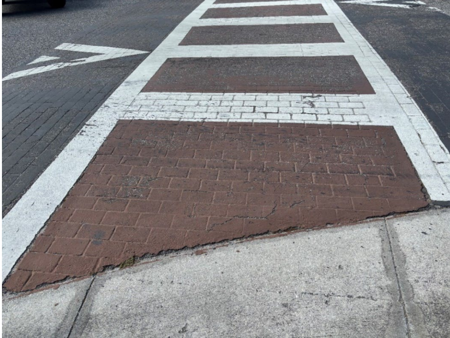
Photo 37 Deteriorating Thermoplastic and Worn Crosswalk Coloration (No Observed Changes) (Refer to Prior Photo 52 – 2025 Assessment)