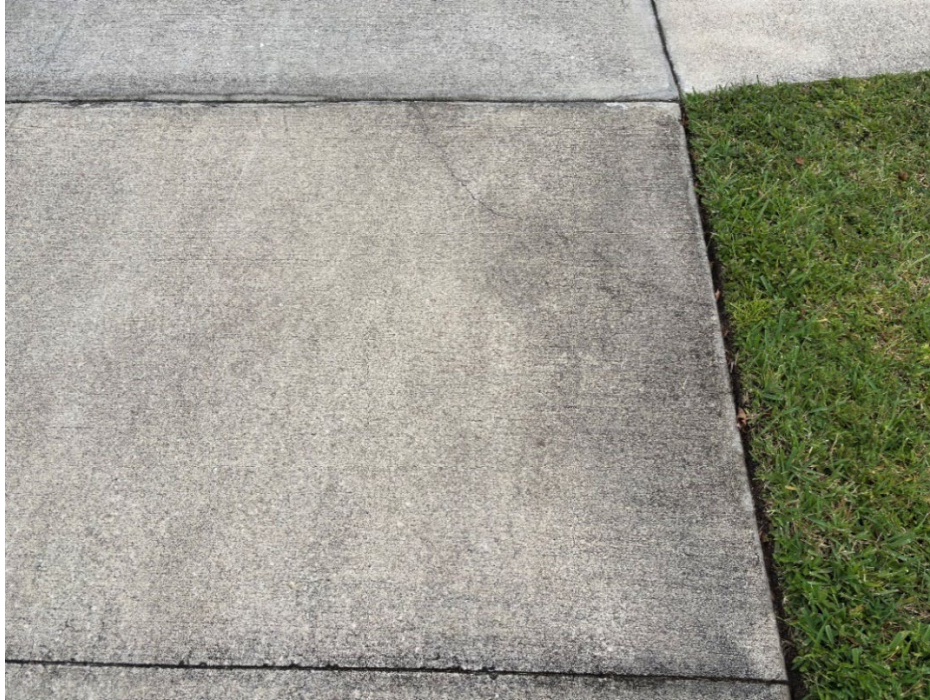
Photo 10 - Cracked Concrete and Base Failure (No Observed Changes) (Refer to Prior Photo 14 – 2025 Assessment)