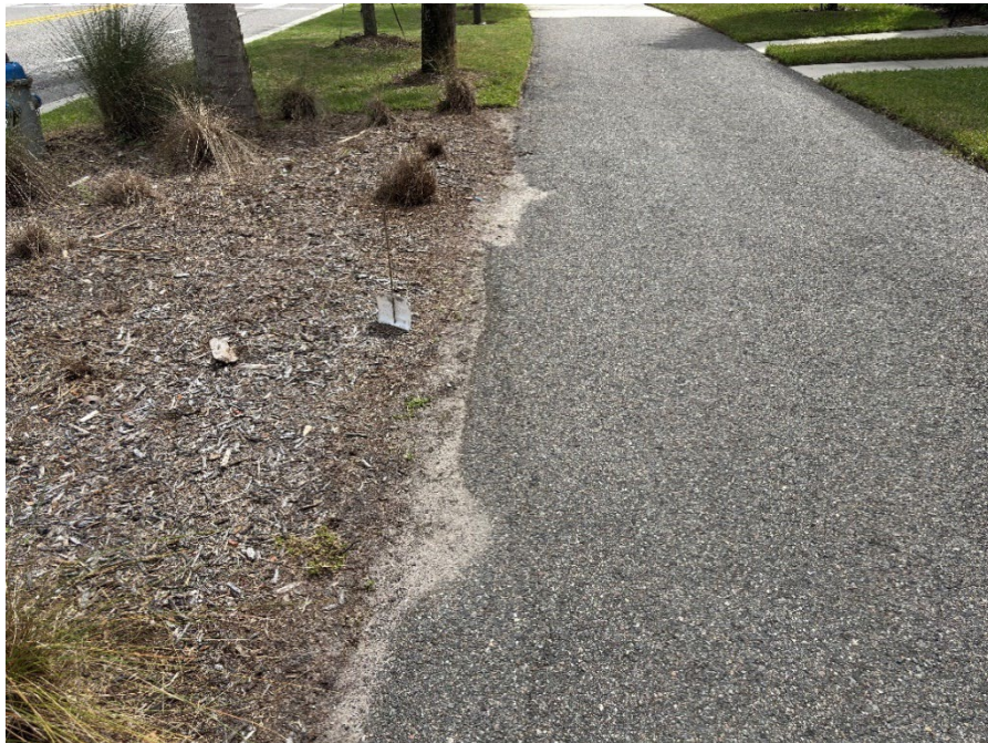
Photo 6 - Asphalt Pavement Edge Failure (No Observed Changes) (Refer to Prior Photo 6 – 2025 Assessment)