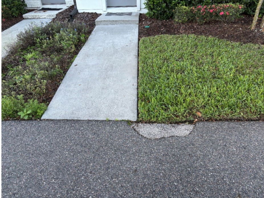
Photo 7 - Poor Asphalt Patch (No Observed Changes) (Refer to Prior Photo 8 – 2025 Assessment)