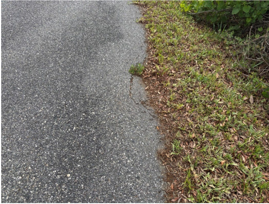
Photo 49 - Asphalt Edge Failure (No Observed Changes) (Refer to Prior Photo 67 – 2025 Assessment)