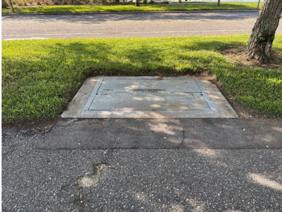
Photo 29 - Poor Quality Asphalt Patch (No Observed Changes) (Refer to Prior Photo 38 – 2025 Assessment)