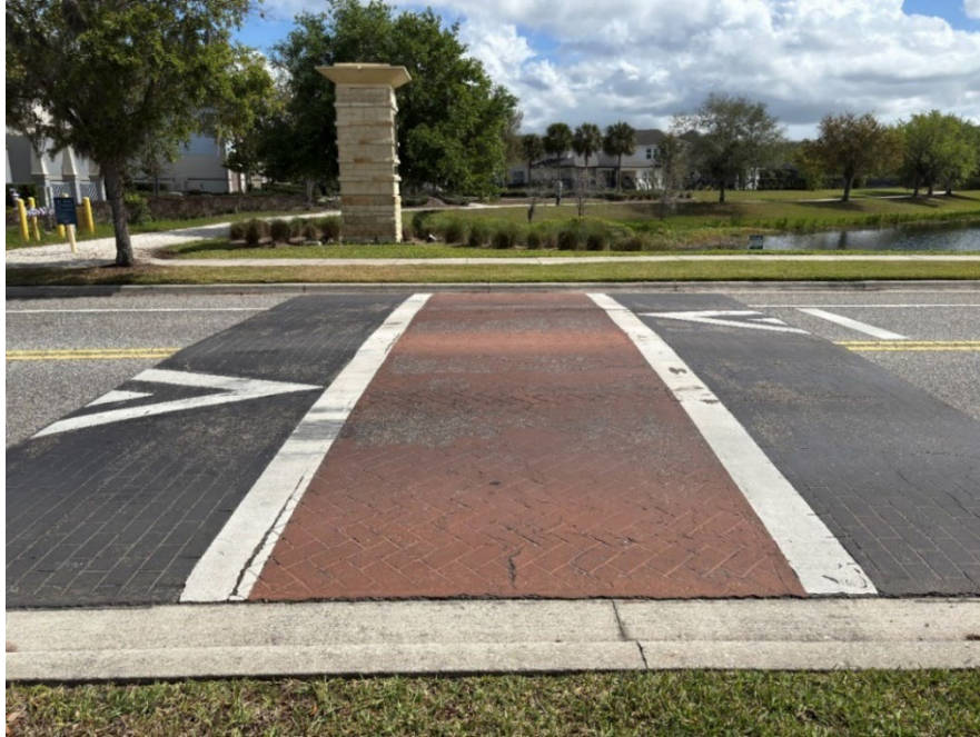
Photo 45.1 Deteriorating Thermoplastic, Worn Crosswalk Coloration, and Asphalt Deformation (New Photo – 2026 Assessment)