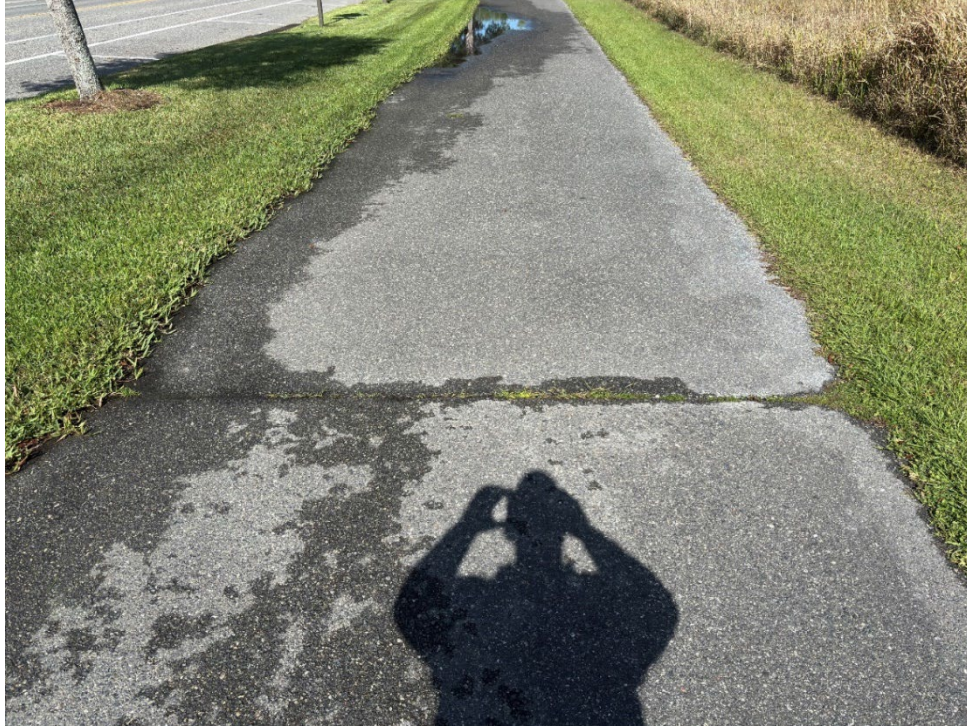
Photo 33 Cracked Asphalt from Side to Side (Increased Cracking Severity Observed) (Refer to Prior Photo 43 – 2025 Assessment)