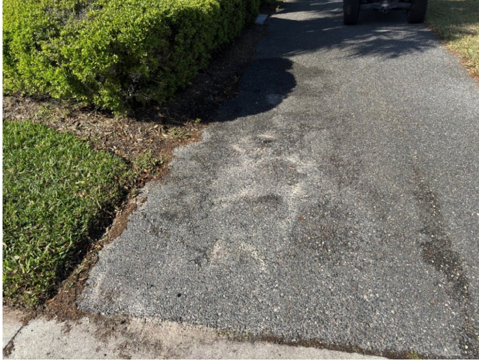
Photo 25.2 – Asphalt Raveling and Base Failure (New Photo – 2026 Assessment)