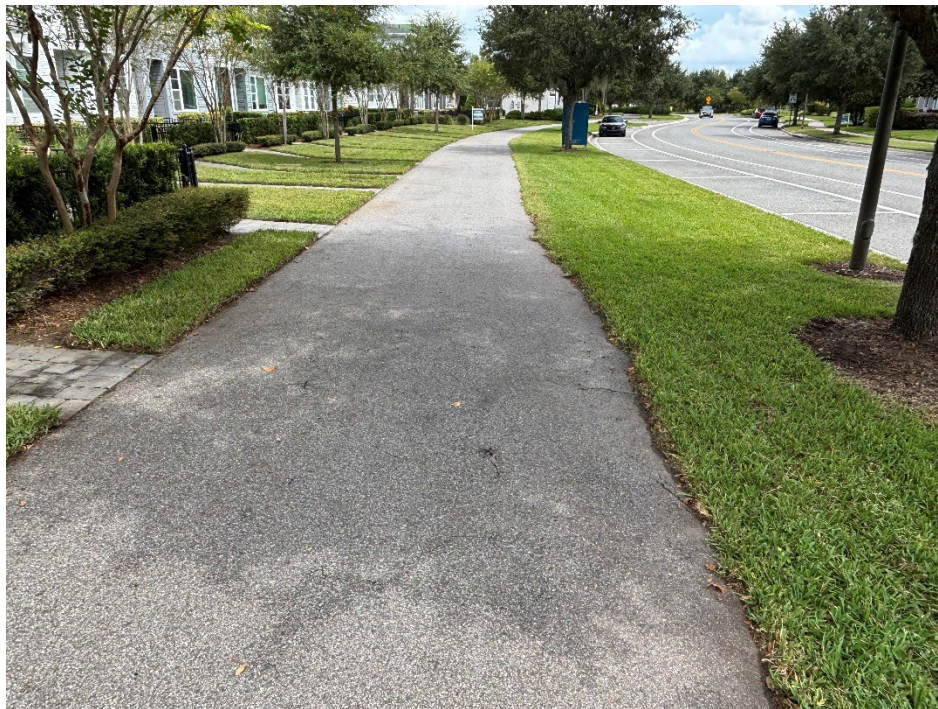
Photo 30 - Asphalt Edge Failure (No Observed Changes) (Refer to Prior Photo 39 – 2025 Assessment)