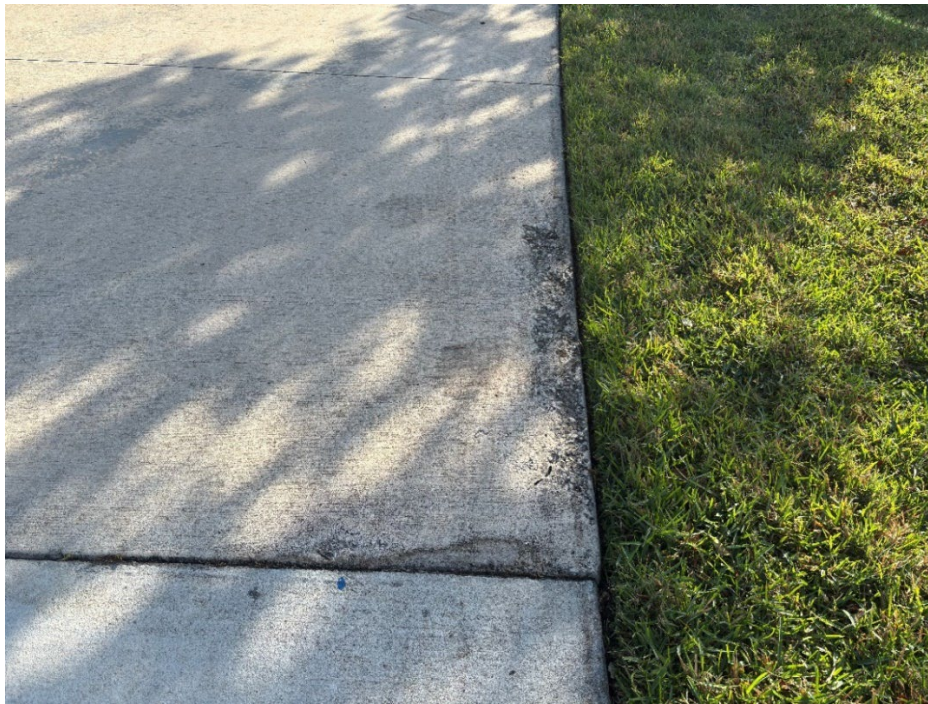
Photo 12.1 – Failing Concrete Edging (New Photo – 2026 Assessment)