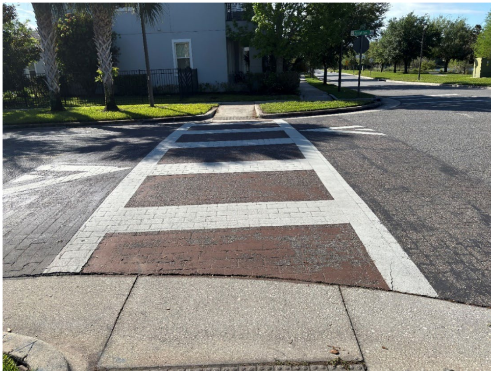
Photo 26 Deteriorating Thermoplastic and Worn Crosswalk Coloration (No Observed Changes) (Refer to Prior Photo 35 – 2025 Assessment)