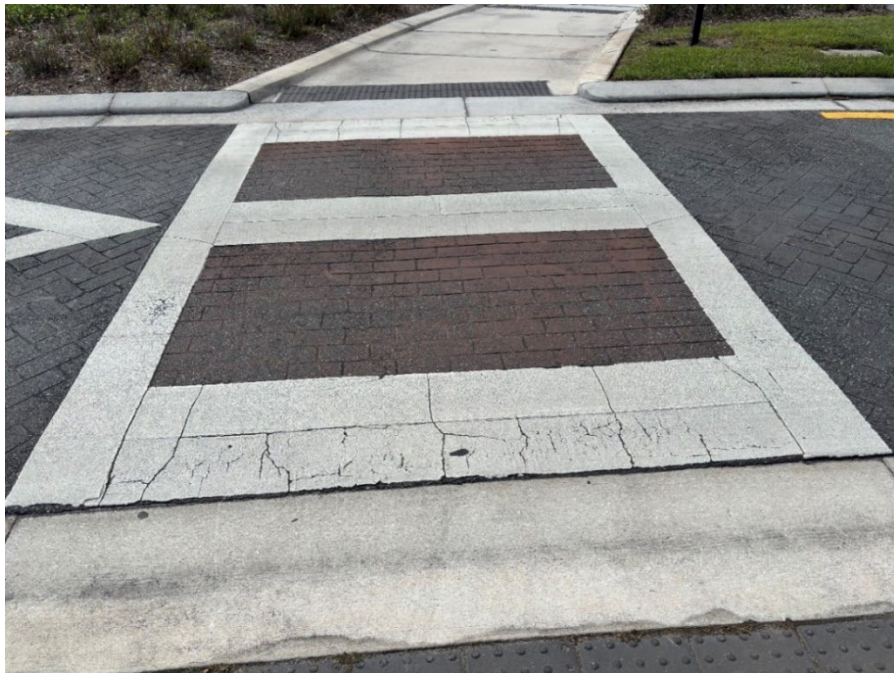
Photo 56 Deteriorating Thermoplastic and Worn Crosswalk Coloration (Further Deterioration Observed) (Refer to Prior Photo 76 – 2025 Assessment)