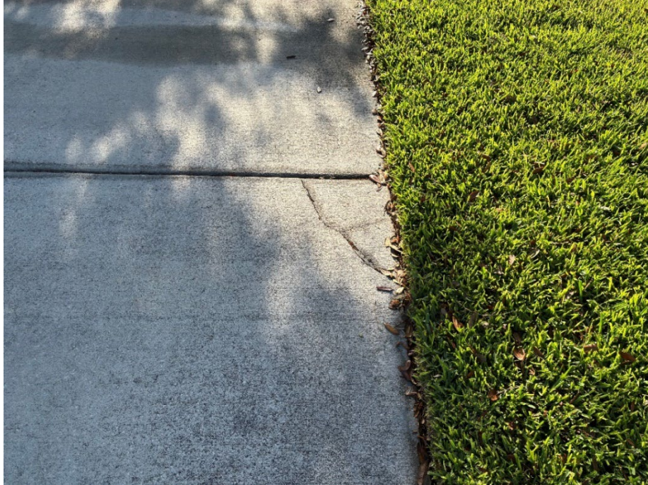
Photo 14 - Cracked Concrete and Base Failure (No Observed Changes) (Refer to Prior Photo 18 – 2025 Assessment)