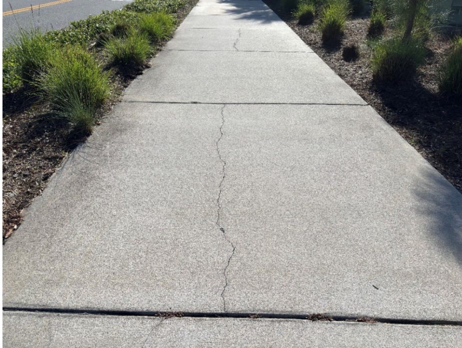
Photo 18 - Surficial Cracked Concrete (No Observed Changes) (Refer to Prior Photo 23 – 2025 Assessment)