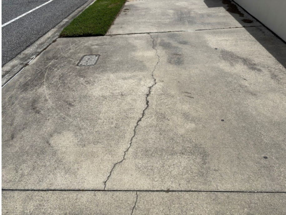
Photo 51 - Surficial Cracked Concrete (No Observed Changes) (Refer to Prior Photo 71 – 2025 Assessment)