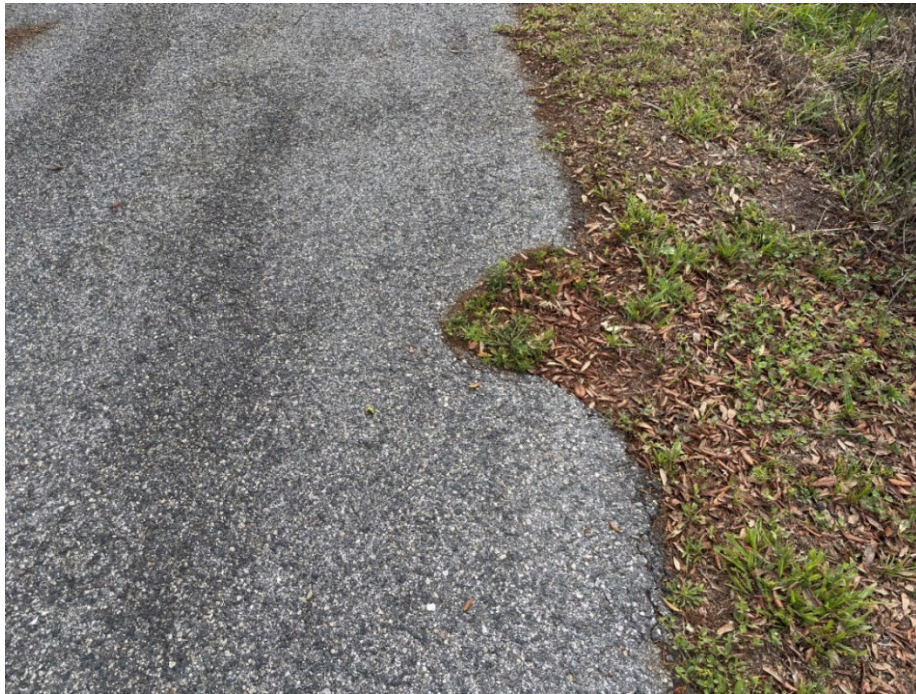
Photo 48 - Asphalt Edge Failure (No Observed Changes) (Refer to Prior Photo 66 – 2025 Assessment)