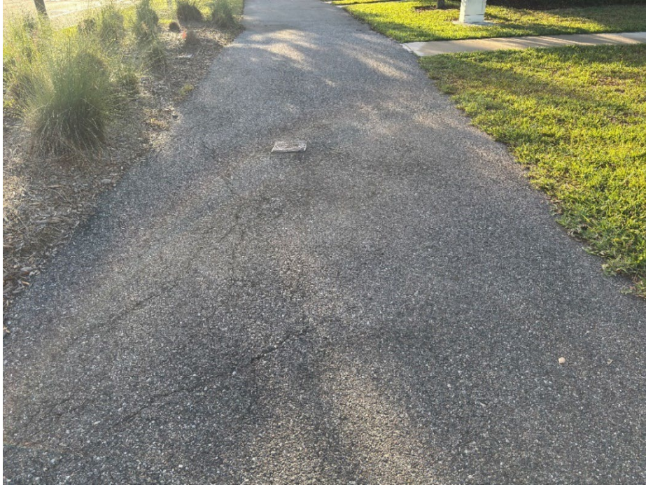
Photo 1 Asphalt Raveling (No Observed Changes) (Refer to Prior Photo 1 – 2025 Assessment)