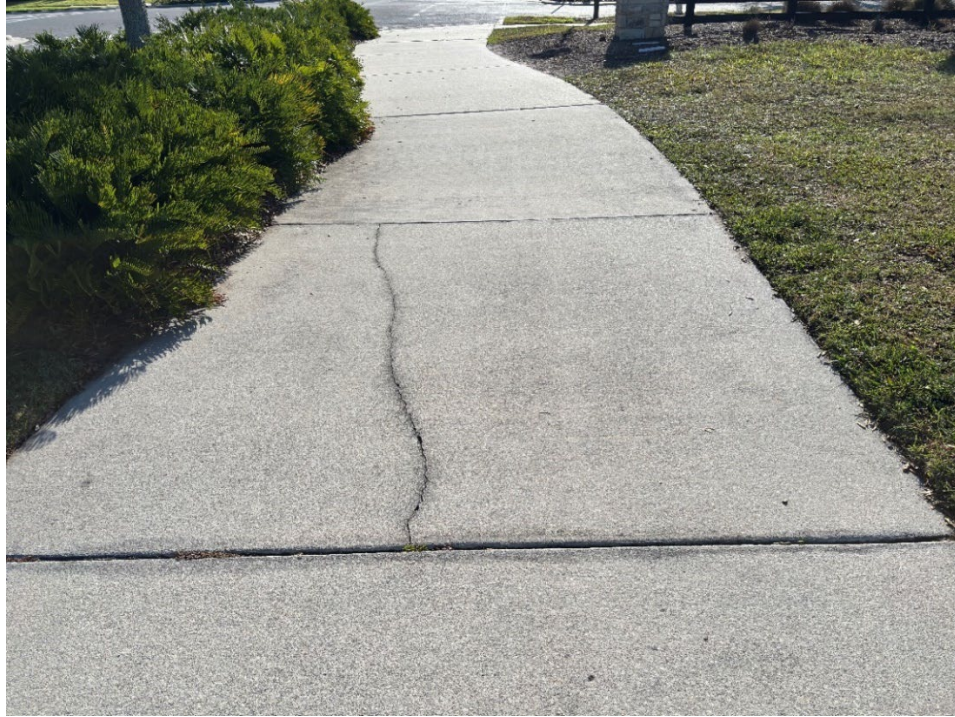
Photo 16 - Cracked Concrete (No Observed Changes) (Refer to Prior Photo 21 – 2025 Assessment)