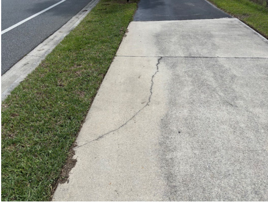
Photo 53 - Cracked Concrete and Base Failure (No Observed Changes) (Refer to Prior Photo 73 – 2025 Assessment)