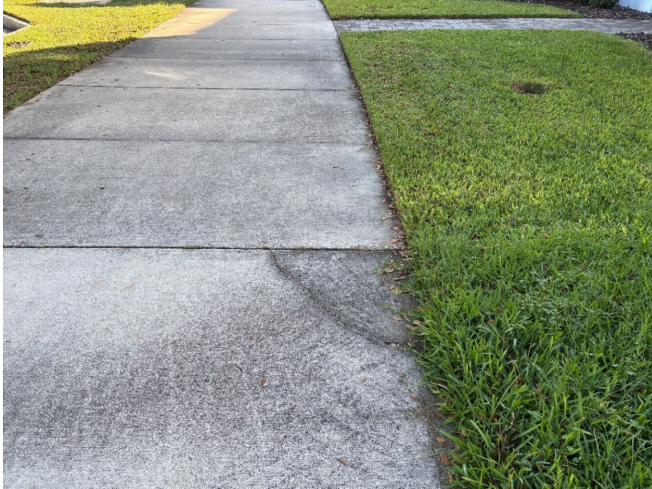
Photo 12 Cracked Concrete and Base Failure (No Observed Changes) (Refer to Prior Photo 16 – 2025 Assessment)