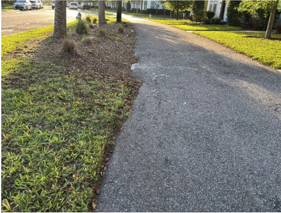
Photo 5 - Asphalt Pavement Edge Failure (No Observed Changes) (Refer to Prior Photo 5 – 2025 Assessment)