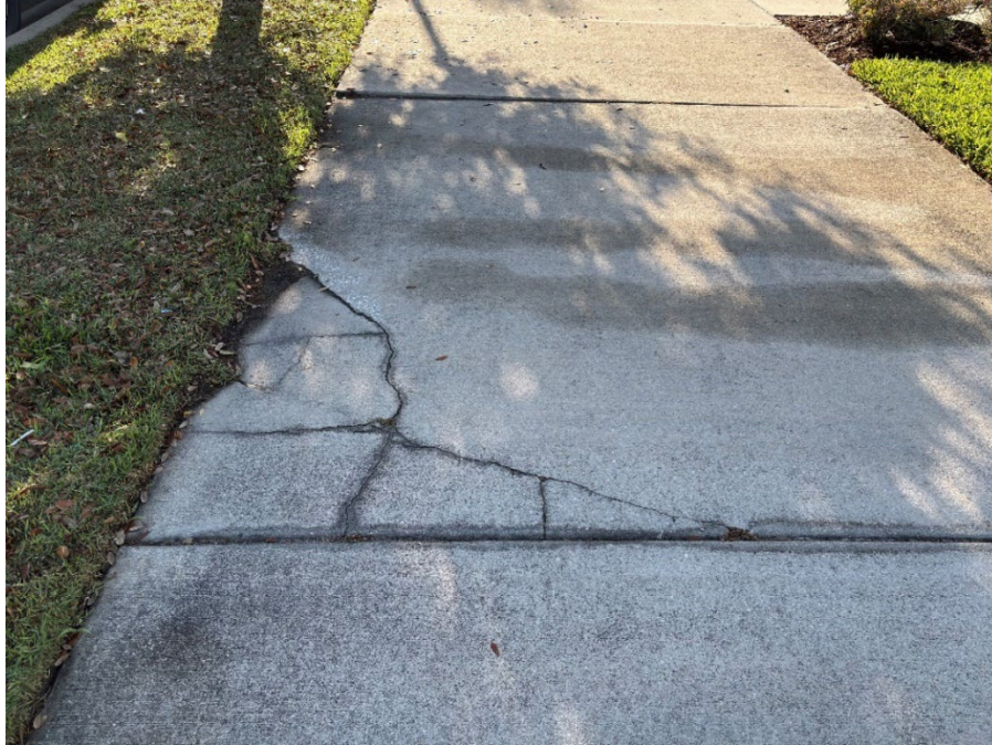
Photo 15 - Cracked Concrete and Base Failure (No Observed Changes) (Refer to Prior Photo 19 – 2025 Assessment)