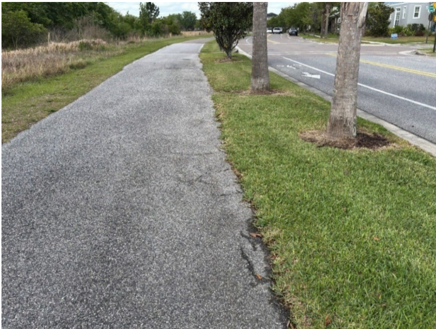
Photo 42 Asphalt Raveling and Base Failure (Further Edge Failure Observed) (Refer to Prior Photo 57 – 2025 Assessment)