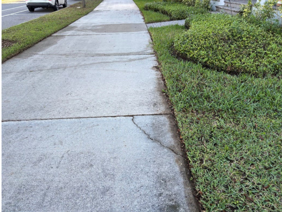
Photo 8.1 - Cracked Concrete and Base Failure (New Photo – 2026 Assessment)