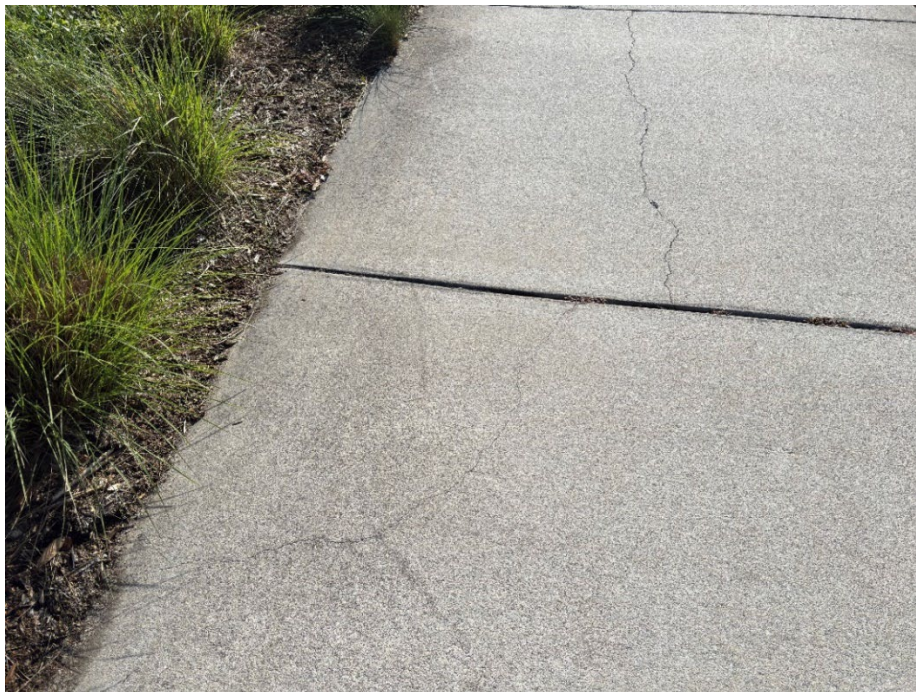
Photo 17 - Surficial Cracked Concrete (No Observed Changes) (Refer to Prior Photo 22 – 2025 Assessment)