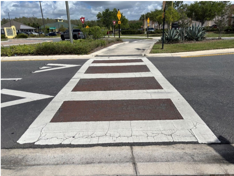
Photo 54 Deteriorating Thermoplastic and Worn Crosswalk Coloration (No Observed Changes) (Refer to Prior Photo 74 – 2025 Assessment)