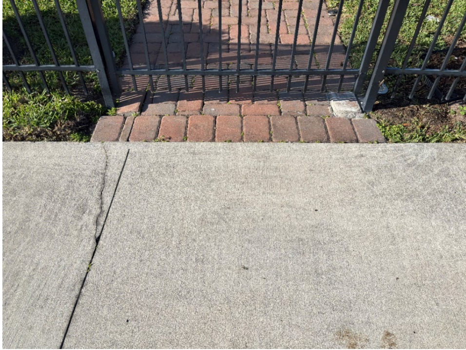
Photo 13 - Surficial Cracked Concrete (No Observed Changes) (Refer to Prior Photo 17 – 2025 Assessment)