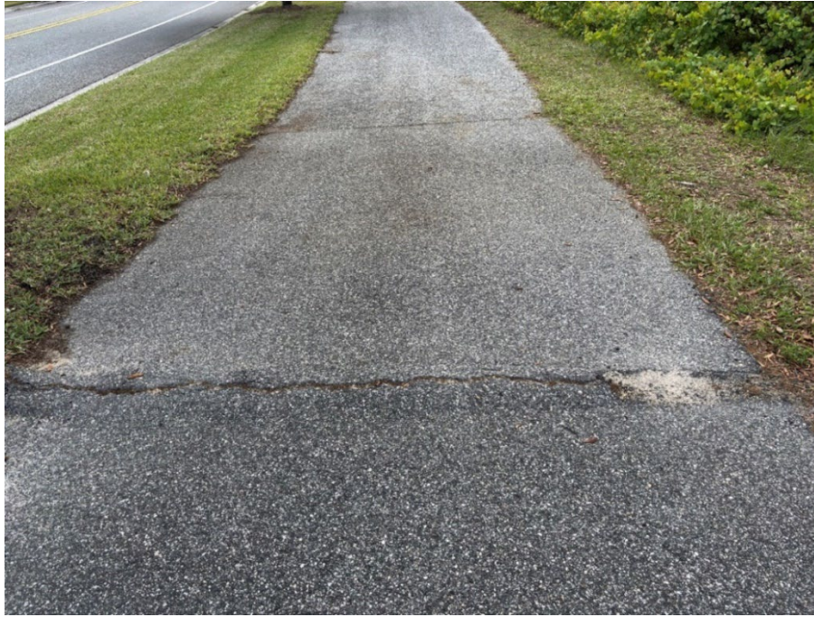
Photo 47 Asphalt Patch Lifting (Cracked Asphalt from Side to Side Observed) (Refer to Prior Photo 63 – 2025 Assessment)