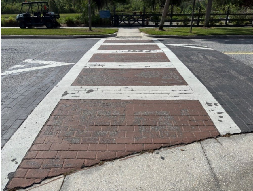
Photo 41 Deteriorating Thermoplastic and Worn Crosswalk Coloration (Further Deterioration Observed) (Refer to Prior Photo 56 – 2025 Assessment)