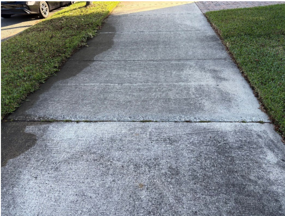
Photo 9 – Concrete Slab Movement (Previously Ground Down - Additional Ponding Area Observed) (Refer to Prior Photo 11 – 2025 Assessment)