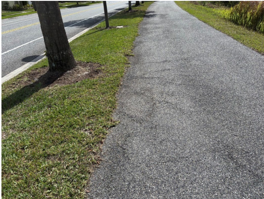
Photo 43 - Asphalt Raveling and Base Failure (No Observed Changes) (Refer to Prior Photo 58 – 2025 Assessment)