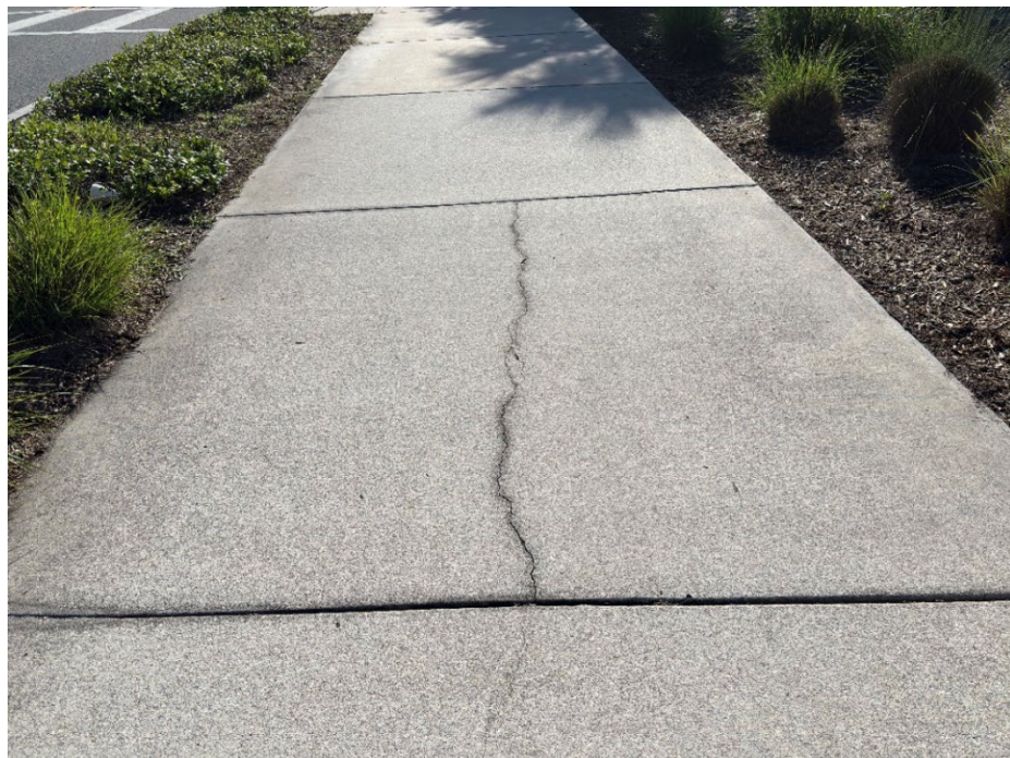
Photo 19 - Cracked Concrete (No Observed Changes) (Refer to Prior Photo 24 – 2025 Assessment)