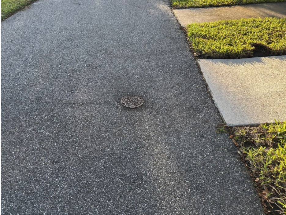
Photo 3 Valve Cover Approximately 1 inch Reveal (No Observed Changes) (Refer to Prior Photo 3 – 2025 Assessment)