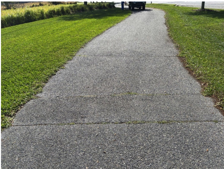
Photo 34 - Cracked Asphalt and Asphalt Raveling (No Observed Changes) (Refer to Prior Photo 47 – 2025 Assessment)